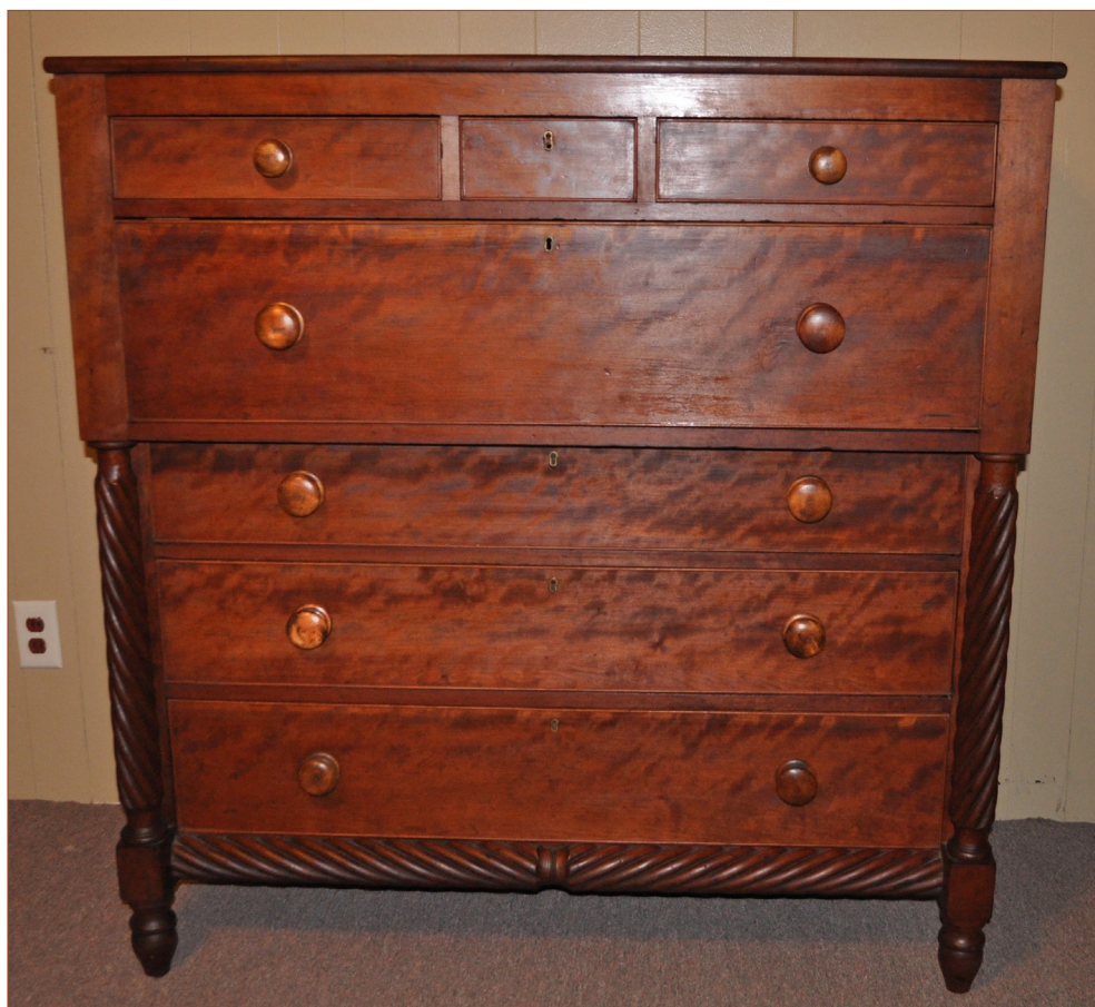
The circa 1840-1860 chest is fashioned from flame mahogany.