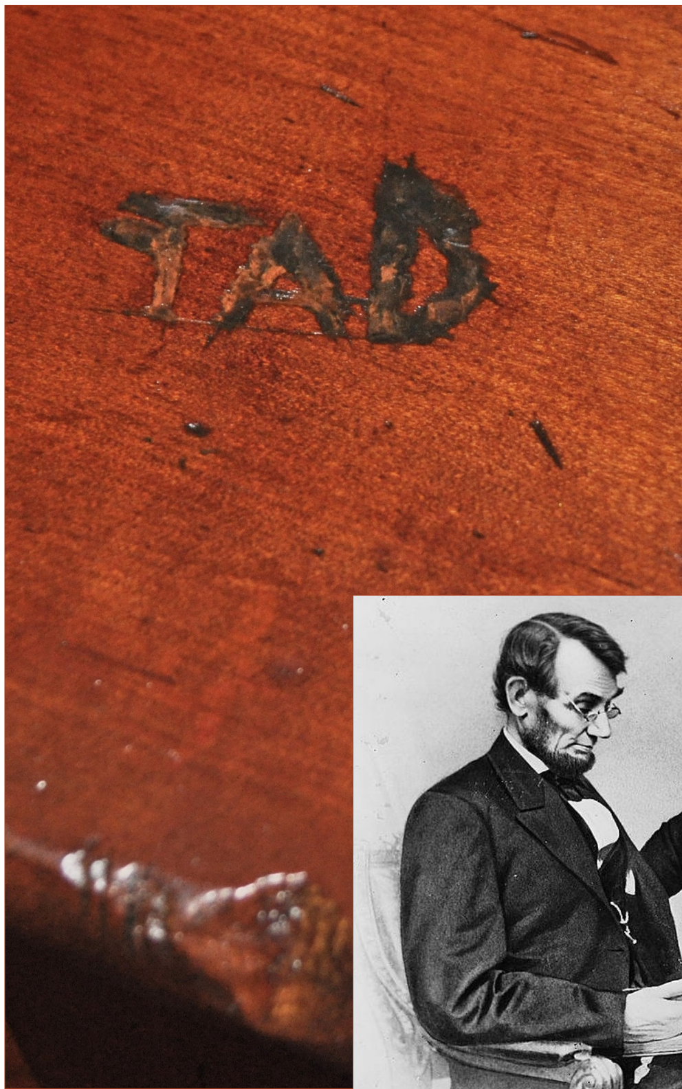
"TAD" is carved into the the top of the chest of drawers, possible by Tad Lincoln, shown at the right with his father, President Abraham Lincoln.